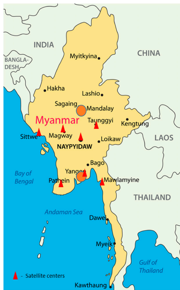
Figure 2. Map showing satellite centers.

Programs are undertaking to endorse the proper referral systems through those 7 satellite centers and to empower general practitioners for early recognition of childhood cancers through continuing education.