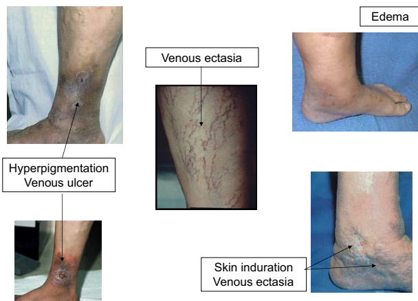
Figure 1. Postthrombotic syndrome.

When patients with PTS experience new leg symptoms or a change in previous symptoms, they may fear that they have a new episode of acute venous thrombosis. It should be explained to patients that it is not uncommon for PTS symptoms to wax and wane over time. If new symptoms in the affected leg develop or if chronic symptoms in the affected leg become worse and there are no associated symptoms that could suggest acute pulmonary embolism, I generally advise my patients to rest their leg and wait a day because in most cases, the symptoms are probably due to PTS and will settle down. However, because patients with PTS are at increased risk of recurrent venous thromboembolism (VTE), if such leg symptoms persist or progress, particularly in the setting of new clinical risk factors for DVT, investigation to rule out recurrent