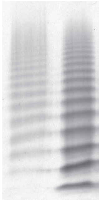
Liver- NMP Expressed VWF

Figure 3. Multimer analysis of transgene encoded VWF expressed in the liver. Multimer analysis was performed on a plasma sample that was isolated from a VWD type 3 mouse 3 days after liver-directed hydrodynamic gene transfer of murine VWF cDNA (liver-expressed VWF). For comparison, the multimer pattern of plasma VWF from wild-type mice is shown (normal murine plasma [NMP]). Adapted from De Meyer et al 92 with permission.